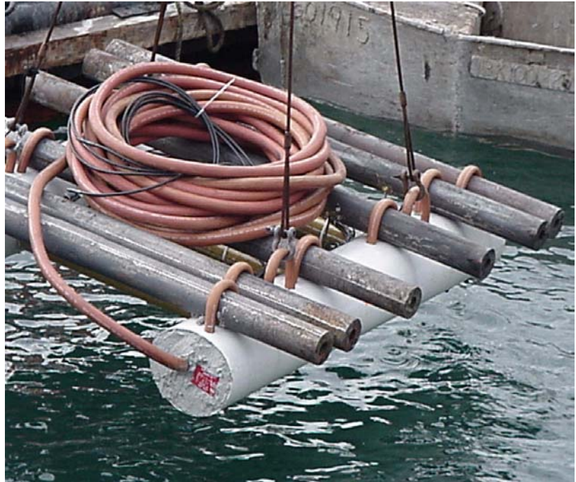
Figure 1: Typical 6 Anode Sled with Shore Lead Cables.