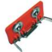
Shunts - 0.001Ω, 0.01Ω, 0.1Ω