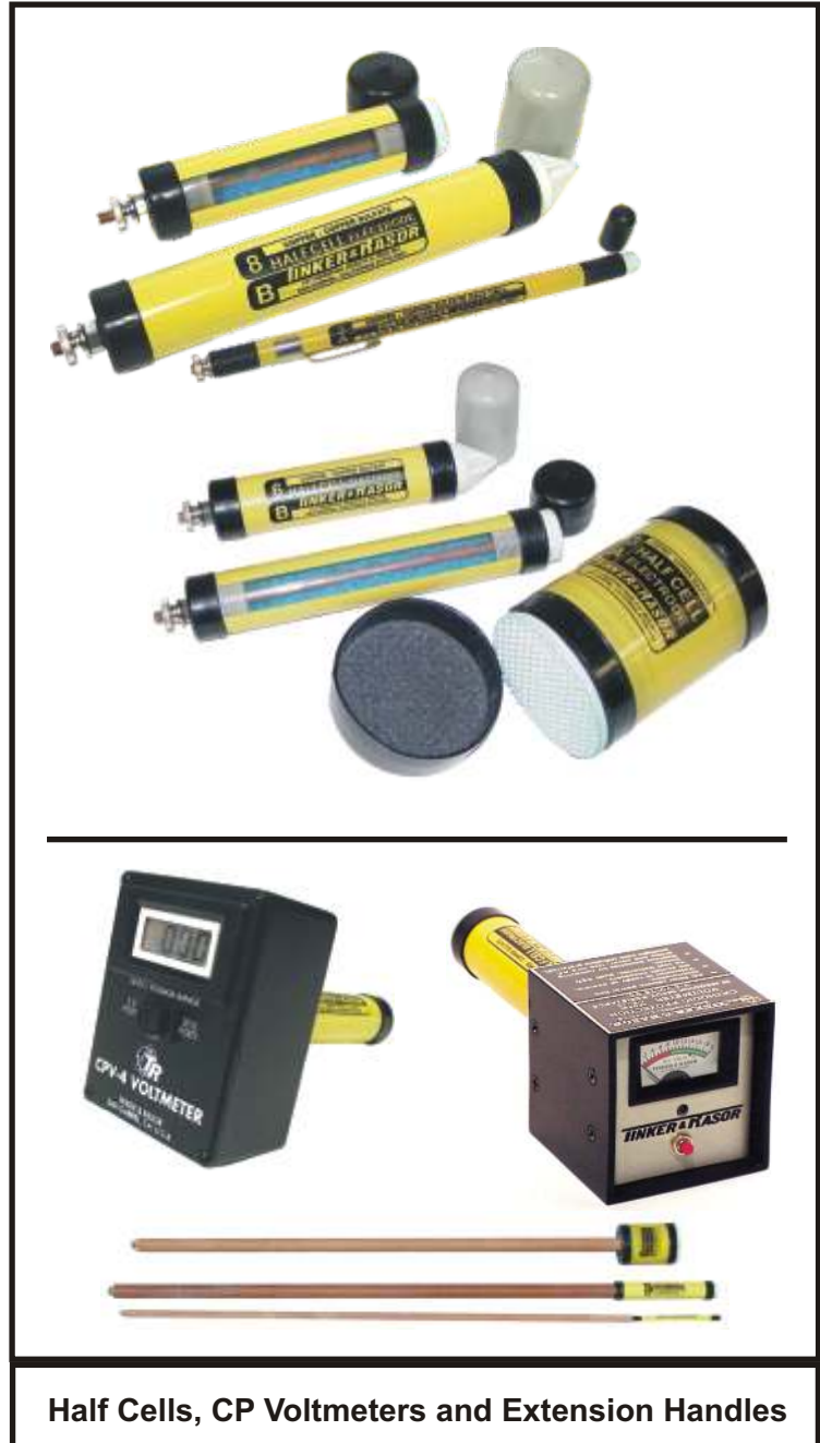
Half Cells, CP Voltmeters and Extension Handles

2-A: 3/8" x 5-3/4" 3-A: 3" x 5" 6-A: 1-1/4" x 6" 6-B: 1-1/4" x 7" 8-A: 1-1/4" x 8" 8-B: 1-1/4" x 9"