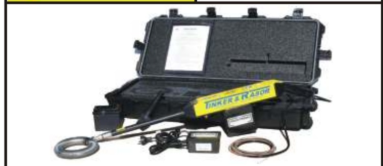
MODEL APS HOLIDAY DETECTOR

DELIVERY: Immediately from STOCK F.O.B. San Gabriel, CA USA