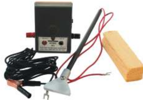
Model M/1 Low Voltage Holiday Detector Kit DC (battery powered) Portable Instrument

DELIVERY: Immediately from STOCK F.O.B. San Gabriel, CA USA SERVICE: 24-hour Turn-Around TERMS: Net30 Days, on approval of credit WARRANTY: 90 Days , parts and labor