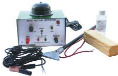
Model M1/AC Low Voltage Holiday Detector Kit AC power supply (110v) In-Plant Instrument