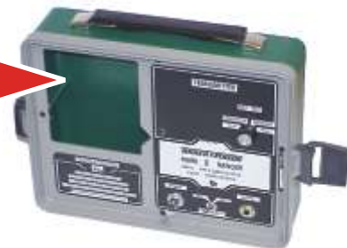
Model Mark V Ranger