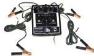
Complete kit with cables